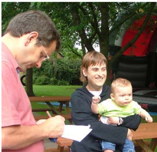
Above and right: Fun Day 2005